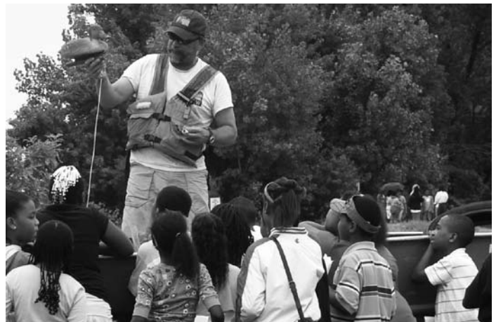
Students get a hands-on look at shovelnose sturgeon at the Missouri River Watershed Festival at La Benite Park in Sugar Creek, MO.